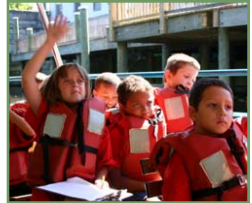
Summer camp participants aboard the Blackstone River Explorer.

The goal of RiverClassroom is to develop historical and environmental