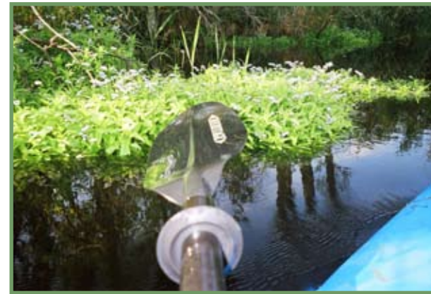
Once you sit down in a kayak, nature is at eye level. Having a field guide handy will enhance your appreciation of The Great Swamp.

If you choose to continue, the canoe camp on the western outcropping of Worden's Pond offers a primitive resting spot before taking on the second section. After your rest, the Charles River can be picked up exiting from a cove in Worden's Pond. The river is a very sinuous, thick woodland environment and is home to numerous