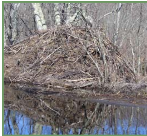
Beaver dams are common in The Great Swamp.

From here, traveling with the gentle flow of the Chipuxet River, moderate paddling will get you to Worden's Pond in about two hours. The passage is wide and the current gentle. The river turns just enough that you can never see too far ahead, leaving surprises around every bend. Red-winged blackbirds sing out to you as they cling to the cattails towering over the side walls, while nesting ducks and the geese, startled to see you, swim speedily away only to greet