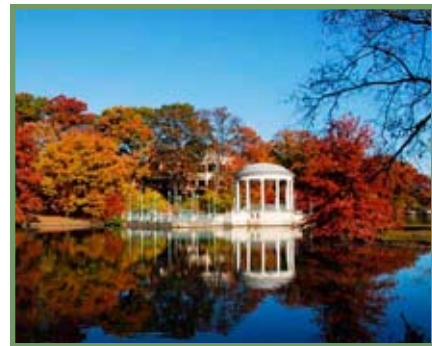
The bandstand at Roger Williams Park.

Roger Williams Park was built in the late 1800's by the renowned landscape architect Horace W. S. Cleveland in an area of over 430 acres of mostly marsh and bog lands. Cleveland's true genius was the utilization of the landscape that scooped out lake beds from the marsh areas and made gentle hills from the excavated material until the true beauty of this jewel of Providence was apparent.