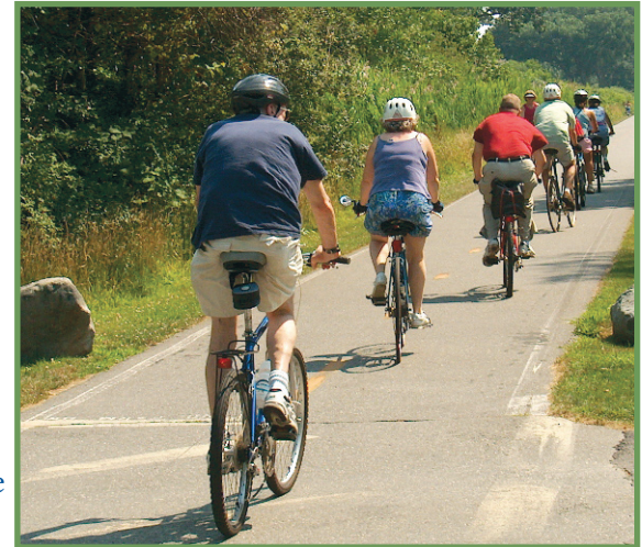
Riders enjoying a bikepath.

Now, flash forward to the present day. We know that the plan was almost universally accepted. A series of municipalities from Pawtucket to the Massachusetts line got on board. And since then, $21 million